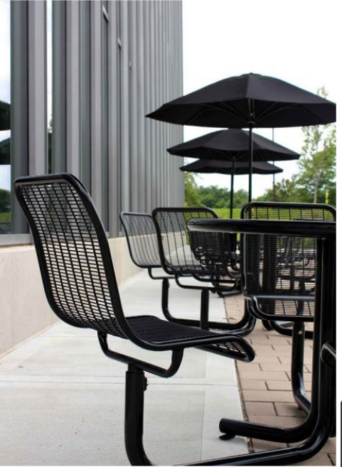
CONCEPTUAL DESIGN FROM ACTIVITAS