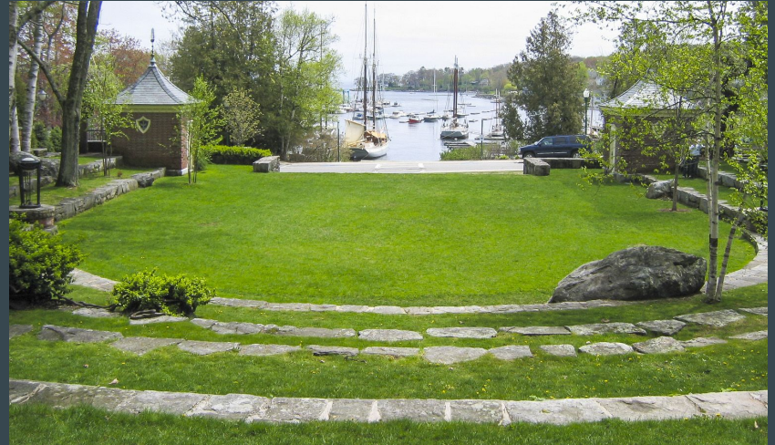
Figure: Camden Library Amphitheatre, Maine

...A center and resource for learning and civic engagement. We provide a place and platform of, by, and for the people who can benefit as individuals as well as contribute to the well-being of the community.