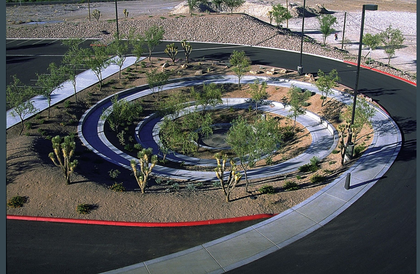
Figure: Garden outside the Sahara West Library and Fine Arts Museum (NV)