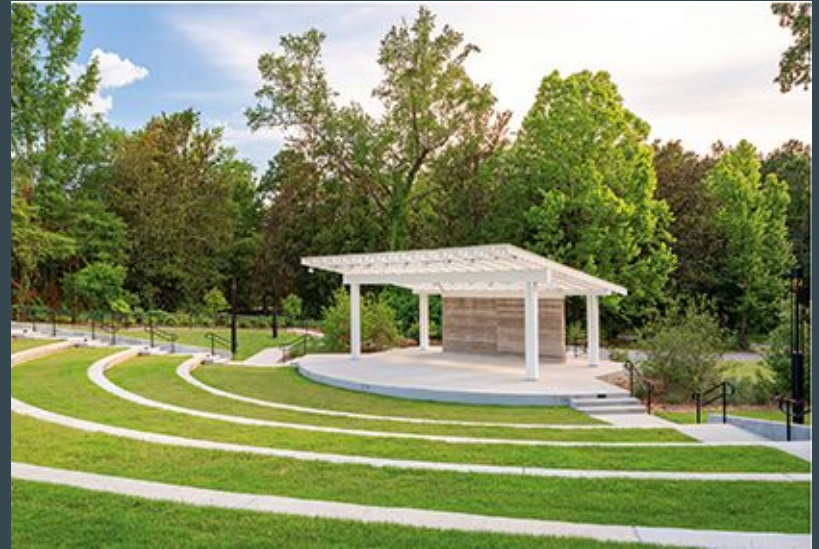
Figure: Amphitheater at the Walterboro Discovery Center, SC