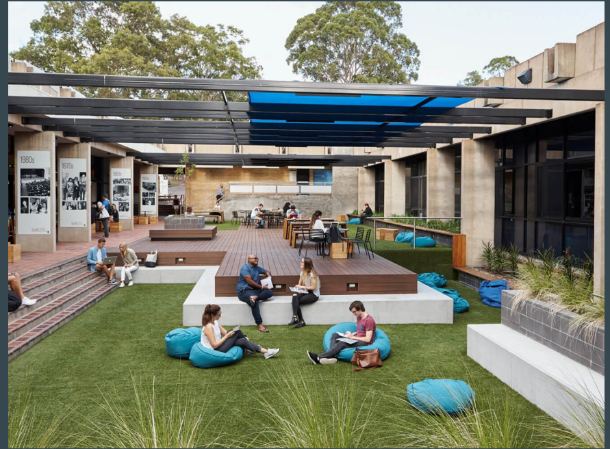
Figure: Outdoor seating at University of Newcastle