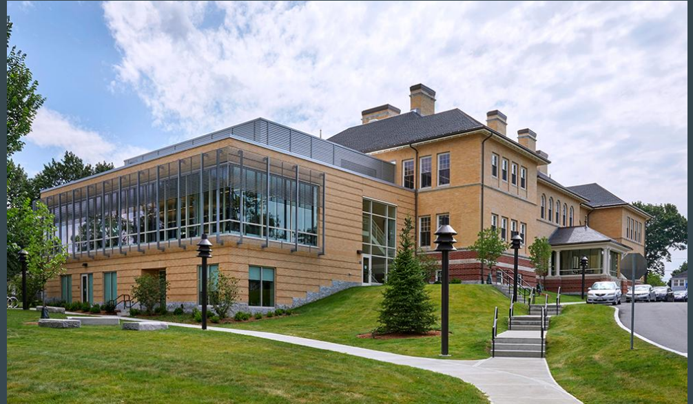
Figure: Reading Public Library

Desirée Zicko - Communications Specialist, Reading Public Library